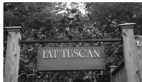
The Fat Tuscan is located at 725 NE 1st Street. Dining is offered indoors or on the patio.